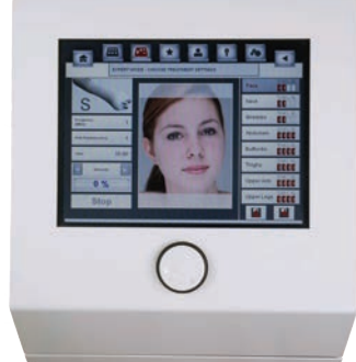
Made in Germany ISO 13485 CE Mark

A Synergistic approach to Beauty<sup>™</sup> Face & Body Treatments | Face and Neck | Skin Tightening | Lifting, Rejuvenation